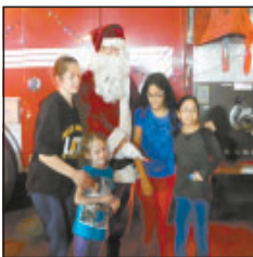
Families gathered in the Kroger parking lot on Normandy, to have their picture taken with Santa.