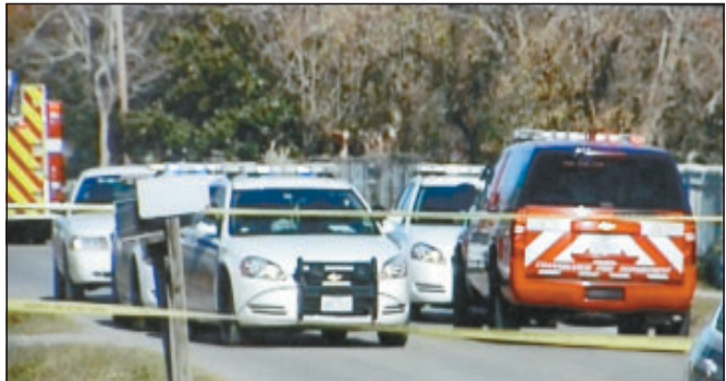
EMERGENCY VEHICLES are on the scene of a shooting in the 900 block of Ashland Road, near Elgin Street in Channelview. They found one person wounded and lying on the ground. Four others were later found at East Houston Medical Center with various wounds, and investigators believe all the injuries are related.

CHANNELVIEW – Investigators for the Sheriff's department are trying to learn the reasons behind a multiple shooting that took place on Sunday, Dec. 15th at about 2:30 pm in the afternoon.