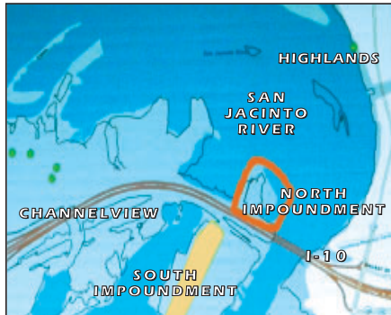
MAP OF THE SAN JACINTO TOXIC WASTE PITS as furnished by the Texas Commission on Environmental Quality, and the US EPA, show the confirmed North Impoundment Superfund Site, and the suspected South Impoundment site.

HOUSTON – Members of a group known as the San Jacinto River Coalition, as well as the TexansTogether organization, staged a demonstration last Wednesday, Dec. 18th to protest the inaction of parties involved in the clean-up of the toxic waste pits in the San Jacinto River near Channelview and Highlands.