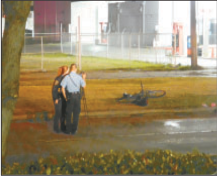
HPD OFFICERS take photos and measurements of the mangled bicycle at the scene of a fatal Hit & Run accident, Friday Dec. 20th on Normandy Drive near I-10. Police are looking for a white vehicle that did not stop after the collision.

Anyone with information is asked to call Houston Homicide at 713-247-4065 or Crime Stoppers at 713-222-TIPS.