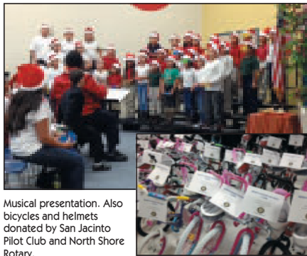
Musical presentation. Also bicycles and helmets donated by San Jacinto Pilot Club and North Shore Rotary.

formed by students from Cloverleaf and Sam Houston Elementary schools. Other community businesses offered their help in putting together the bikes, providing snacks for the children. The Pilot Club donated helmets, while the Rotary Club donated the bikes. San Jacinto Pilot Club is a 501(c)(3) organization dedicated to brain safety and fitness. For more information, visit www.SanJacintoPilot.com and www.PilotInternational.org .