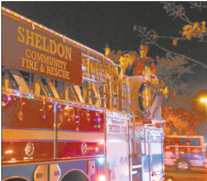
SANTA and his Elf helper arrived on a Sheldon Fire Department ladder truck, decorated for the Holiday Season with lights and Christmas greetings.

Other Christmas parades were held by Galena Park and Jacinto City fire departments earlier in the month.