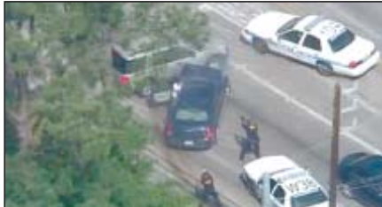
Houston Police fire on suspect after chase, as he reaches inside his car for an unknown object.

Two HPD officers in pursuit exited their units and