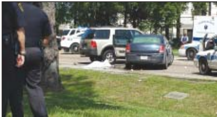
Suspect lies on ground, shot after a high-speed police chase.

The suspect drove from the Eastex onto Beltway East, then south on the Sam Houston Tollway.