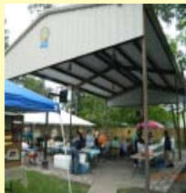
Rotary Pavilion and Multi-Purpose Meeting and Sports Facility