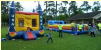
Bounce House and Pull Competition Slide

For more information, you can call them at 281-459-4555 or visit youth-reach.org.