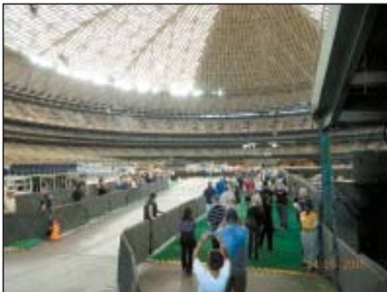
Over 25,000 people were able to view the inside of the Astrodome as part of the Birthday Celebration. Many commented that they were overwhelmed by the site, or had memories of their attendance over the years.