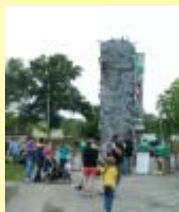
Rock Climbing kept everyone at the end of their rope