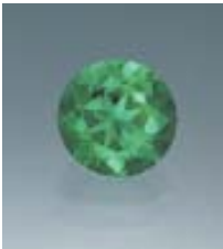
Zambia. The availability of high-quality emerald is limited; consequently, treatments

Emerald As the birthstone for May, the emerald, a symbol of rebirth, is believed to grant the owner foresight, good fortune, and youth. Emerald, derived from the wordsmaragdus, meaning green in Greek, was mined in Egypt as early as 330 B.C. Today, most of the world's emeralds are mined in Colombia, Brazil, Afghanistan, and