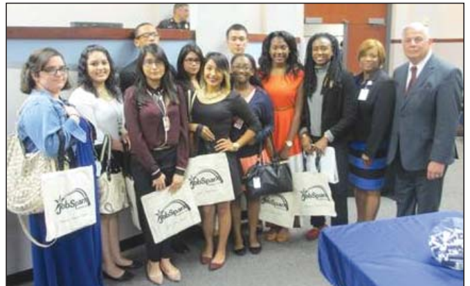
Congressman Gene Green with student from North Shore Senior High at his 13th Annual Job Fair at San Jacinto College North. SEE STORY, page 3