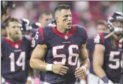
Brian Cushing, Texans football player wears # 56.

Register at BRIAN CUSHINGCAMP.COM to get your opportunity, enter promo code "PRESS" to receive 10% registration discount.