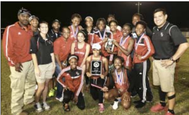
The North Shore girls track team earned 2nd place at the area meet, sending 8 athletes to the regional track meet.