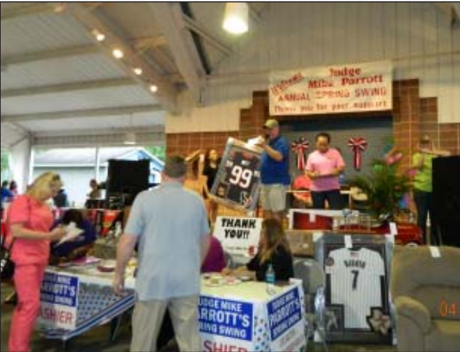
ONE OF THE MOST POPULAR ITEMS that was auctioned in the Live Auction was a Jersey for #99, J. J. Watt. There were a total of 46 items on the list, including Texans and Astros game tickets.