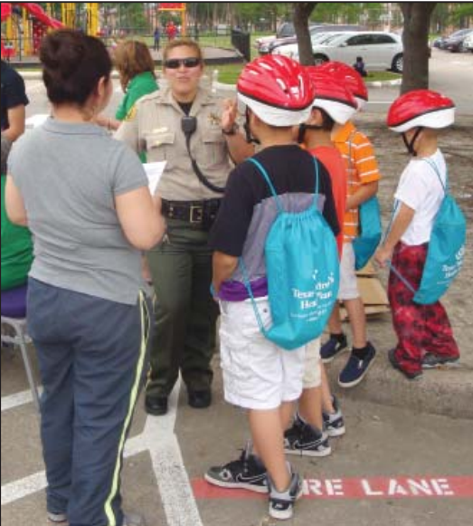
Pictured to the left, kids at the Bicycle course last Saturday at YMCA Healthy Kids Day. They were given the red helmets for their participation in the course.

Wendel D. Ley Family YMCA hosted a day full of fun and healthy activities for kids last Saturday, April 26, 2014. The Healthy Kids Day provided free immunizations and activities included fitness fun, kid friendly games and many more. Parents also could register their kids for the summer program. Kids enjoy to learn about bike safety and kids with scooters, bikes or skateboards received a free helmet courtesy of San Jacinto Pilot Club. YMCA Healthy Kids Day is a celebration where they make fitness fun through programs that teach ways to play and to stay active, connected and healthy.