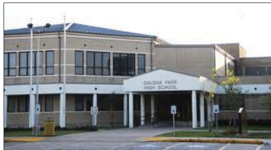
Galena Park High School

GALENA PARK, TEXAS—Students and staff at Galena Park High School were evacuated last Monday morning after a bomb scare.