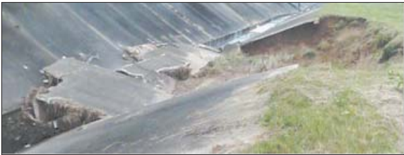
MAJOR OBSTRUCTION SEEN LOOKING EAST TOWARD HOLLAND.