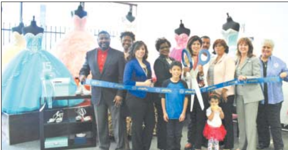
Ellida's Bridal, located at 12450 East Freeway #125, Houston, TX. 77015. This is her 2nd location.

•Second Street Church of Christ, 15821 2nd. Street, Channelview, TX. 77530. www.2ndstreetchurchofchrist.com