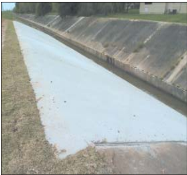
THE OBSTRUCTION OF JACINTO CITY MAIN DRAINAGE KNOWN AS 'TURKEY RUN GULLY' HAS BEEN REPAIRED AS AUTHORITIES DISCUSSED AND APPROVED AS FIRST PRIORITY LAST JUNE.