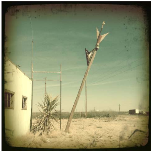
Old store in Orla, Texas.

names as well. Granted at many of the places named, nothing exists - at least not anything that you can see from the public roadways. Sometimes in my quest I come up empty on finding compelling places but that's just part of the hunt. Each place, regardless of how many build-