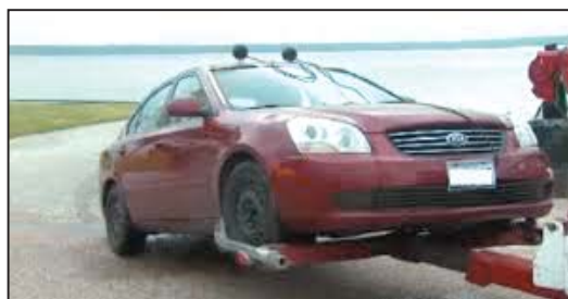
A tow truck pulls out the red car from Lake Houston.

According to the Fire Department, the accident happened around 9 a.m. near the Duessen Park Boat Ramp in North Shore after fishermen saw the maroon sedan go into the water.