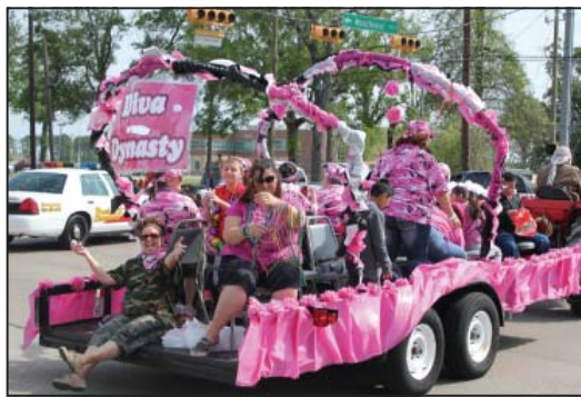
Diva Dynasty float

A large number of exhibitors were included this year, with 88 lots put up for auction. Veteran auctioneer Lynn Spell kept the bidding lively, and brought good results for the exhibitors. The Sweetheart Cake, shown by Cyndee Beach,