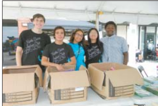
Members of the North Shore Anchor Club, which is sponsored by the San Jacinto Pilot Club, were on hand to help stuff backpacks with School supplies.