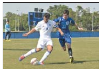
Five San Jacinto College men's soccer players signed National letters of Intent to continue their education and soccer careers at four-year institutions.