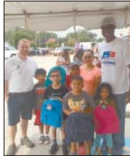
At North Shore, the goal was to give out 1000 backpacks. Hot dogs, jump houses, and fire trucks were all part of the fun.