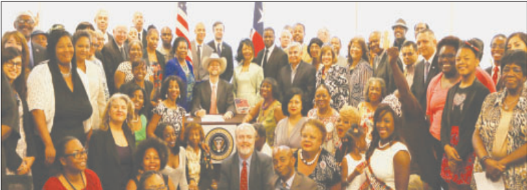
Participants of the Voting Right Act reenactment at Houston's Federal Building. Congresswoman Sheila Jackson Lee centered in blue sponsored the event.