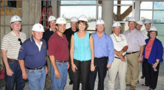
United States Maritime Administrators and staff from local State Rep. visit San Jacinto College Maritime Technology site.