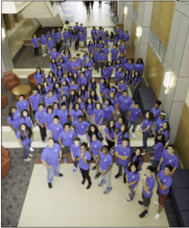
Students, teachers and administrators of the GPISD CET ECHS gathered at San Jacinto College North for Lion Camp.