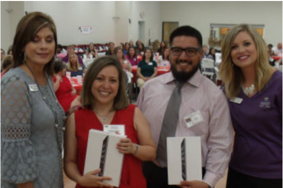
Both Community Resource Credit Union representatives attend the gift of two new iPad Airs to two Huffman Teachers at the Crosby-Huffman Chamber of Commerce new Educator's Luncheon.