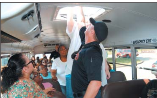
Channelview transportation personnel shows firefighter the use of emergency exits in the bus.

Channelview Fire Department works closely with Channelview ISD Transportation Department. This showed on August 13, 2014 when over 90 bus drivers and 8 personnel from Channelview Fire Department got together and shared information. Channelview Fire Department taught the bus drivers about home fire safety, how to safely use fire extinguishers using the PASS technique, reviewed the use of their bio hazard and fire aid kits they carry on their bus and also answered any ques-