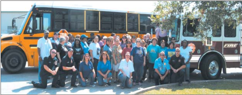
Channelview Fire Department and CISD Transportation staff after the training session.