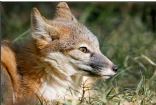
The Swift Fox in Texas

In size, the swift fox is small and not much bigger than a large house cat. Standing about a foot high at the shoulders and just shy of three feet long from nose to tail, swift foxes weigh an average of six pounds. Essentially, males and females are identical in appearance as they are light