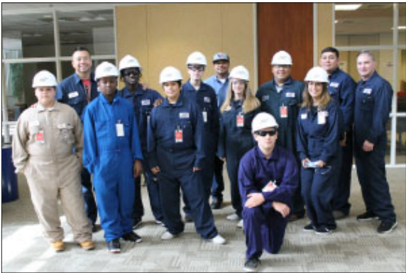
Students participating in the Highlands Junior School summer program "Young Dream Changers" met operators working at Chevron Phillips Chemical's plant in Baytown to learn about career paths in the petrochemical industry.

"Once I started on this path I haven't looked back. I have a great job that supports my family