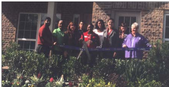
North Channel Chamber of Commerce would like to welcome new members Homes for Heroes. They hold a ribbon cutting on November 10, 2016.