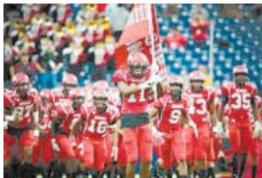
The North Shore Mustangs have defeated Dickinson 17-7 and Katy 20-17 in the regional play-offs.

now 12-1, go on to the regional semi-finals Friday against Atascocita (11-1). A large contingent of fans is expected at the NRG stadium to cheer the Mustangs on toward the state playoffs.