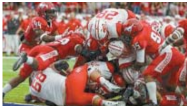
The Mustang defense was the key to victory in the game against Katy. The goal line stand stopped them on the 1 yard line.

Katy's five year championship run ended with a 10-3 record, while the North Shore Mustangs,