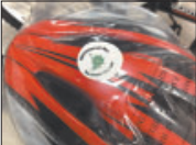
Helmets were sponsored by San Jacinto Pilot Club

Wednesday, December 9, 2015, the San Jacinto Pilot Club joined the North Shore Rotary Club to donate 130 bicycles (from Rotary) and helmets (from Pilot), assembled by LyondellBasell, to elementary school students who had perfect attendance in the after school program sponsored by Harris County Precinct2Gether. Many thanks to Texas Medical Association's Hard Hats for Little Heads for partnering with us to help fund the helmets.