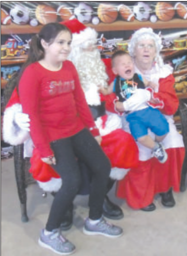
Kids asks Santa & Mrs. Clause for joy, gifts and peace last weekend in Crosby