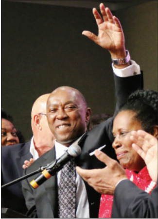
Sylvester Turner gives a Victory Wave to his supporters last Saturday night at the George R. Brown Convention Center.