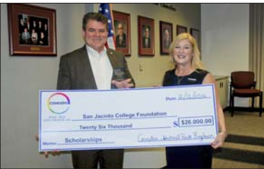
The San Jacinto College Foundation presented Covestro LLC with a recognition award for its $26,000 donation benefitting scholarships for industrial technology students at the College’s December Board of Trustees meeting.