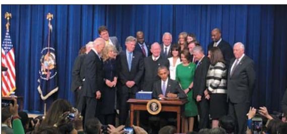
President Obama signs 21st Century Cures Act, with Congressman Gene Green and other legislators that co-sponsored the bill looking on.

WASHINGTON, D.C., December 13, 2016 - Today, President Barack Obama signed into law legislation that will accelerate the pace of medical innovation and deliver cures to patients who desperately need them -- the 21st Century Cures Act. This landmark bill co-authored by Rep. Gene Green was overwhelmingly passed by the