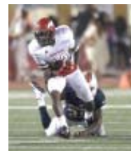
North Shore #40 rushes out of an Eagle grasp for a gain.

ta 12-1. The Eagles will play another game, against Lake Travis Saturday in the Alamo Dome.