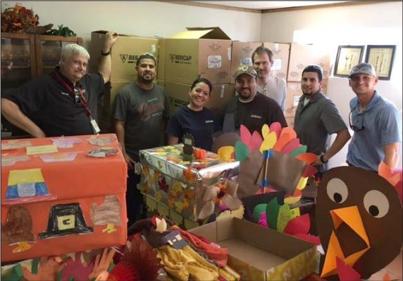
Highlands Chamber members and volunteers donated and help sorting and packing 85 boxes of food to distribute to families for Thanksgiving. Thank you Sampson Lodge, Highlands Rotary Club, Shine Dental and all the others who donated food, money and time to help other at this time of thankfulness.