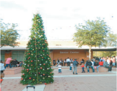
The Annual Tree Lighting of the Jacinto City Christmas Tree took place in the courtyard of the Town Center and Senior Center, at the end of the ceremonies.