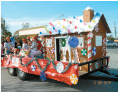
The Gingerbread House not only made us hungry, but won the Award for Most Beautiful for the Jacinto City Elementary School.