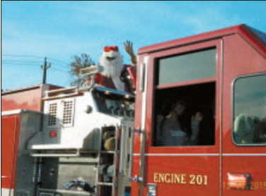
HO! HO! HO! Santa was happy to arrive in Jacinto City in a fire truck, instead of his usual sleigh, since there was no snow, just a beautiful sunny day.

Most Beautiful Float: JC Elementary School; Most Original Float: