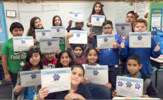
McMullan Elementary fifth grade students learned about responsible pet ownership and animal welfare issues as part of a presentation through the Harris County District Attorney's Office HOPE (Helping Our Pets through Education) program. The program educated students on proper pet care, age-appropriate information on animal cruelty laws, and what to do if the student encounters animal cruelty. The program's mascot "Hope" was also present during the presentation. At the conclusion of the program, students were awarded certificates reflecting what they had learned about being a trustworthy pet owner.