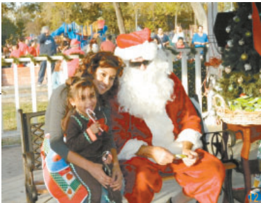
Santa Claus was busy for most of the afternoon, listening to the wish lists of children and adults alike. Here a happy little girl hangs onto her candy cane as she tells Santa about her Wish List.