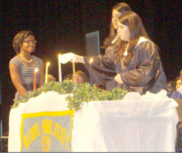
Candlelighting ceremony welcoming new National Honor Society members.

-Monday, Dec. 14, Teen Time, 4:00 pm. -Wed., Dec. 16, Storytime, 11 am. -Thurs., Dec. 17, Babytime, 10 am; Christmas Craft, 4 pm. -Tues., Dec. 22, Pictures with Santa, 6 pm. -Wed., Dec. 23, Storytime, 11 am. Please call the library at 713-450-0982 for more details. The library is located at 1500 Keene St. Galena Park, TX. 77547.