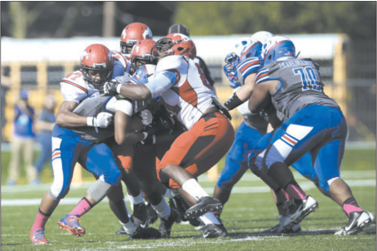
The Mustang defense stuffed the running game, holding Dickinson to -13 yards on 31 rushes. The defense also forced four turnovers, three interceptions and one fumble. MORE PHOTOS ON PAGE 2.

The Mustangs struck first in the second half with a one-yard touchdown run by Guillory. Dickinson struck back on their ensuing drive with a touchdown of their own; however, it would be the last time they scored. The final three scores of the game came from the Mustangs offense,