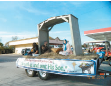
Honorable Mention Float Award went to the 1st Baptist Church of Jacinto City, for this Creche.