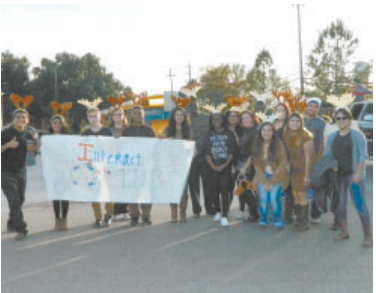
Marching units included many organizations, as seen here the GP/JC Rotary Club's Interact student members.