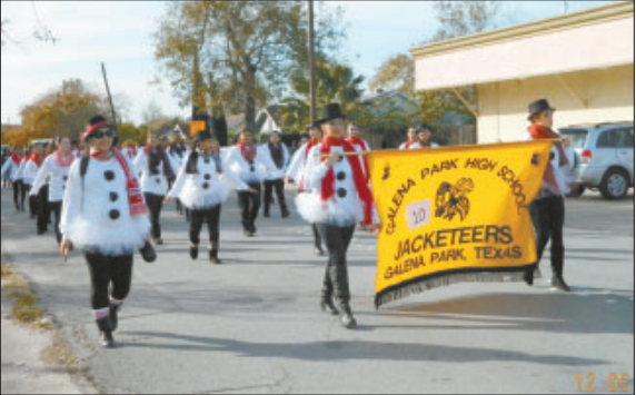
THE GALENA PARK HIGH SCHOOL Jacketeers were just one of 39 parade units this year, that made it the largest parade in recent years. The Jacketeers won the Mayor's Choice prize in the judging of parade units and floats. SEE MORE PHOTOS ON PAGE 8.