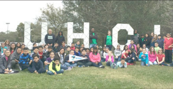
Students from Channelview ISD's DeZavala Elementary School took a field trip to the University of Houston-Clear Lake as part of College Week activities. The students were able to visit lecture rooms on campus, as well as other areas. UHCL representatives answered a variety of questions from the students about college requirements and the importance of higher education.