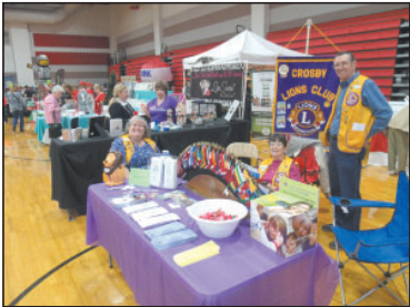
Crosby Lions Club had a booth at the Crosby-Huffman Chamber of Commerce Craft & Consumer Expo last Saturday, February 6, 2016.