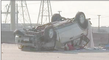
A man died in the chain crash when his car rolled several times.

HOUSTON - A suspected drunk driver was arrested after a fatal multi-car crash on East Freeway last Saturday, Feb. 13.