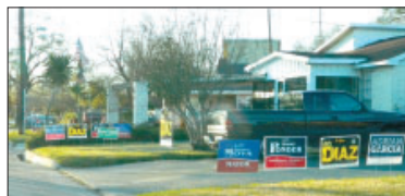
Like Flowers in Springtime, yards in Galena Park have blossomed with Political Signs for local candidates.

Early voters in Channelview go to North Channel Library Branch located at 15741 Wallisville Rd. Crosby voters go to the Crosby Branch Library at