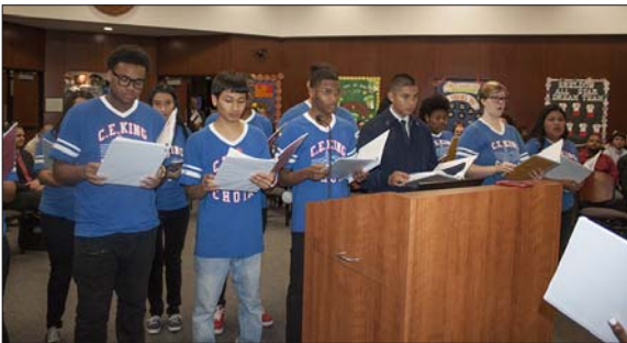
Members of the C. E. King High School Choir performed a song at the Jan. 17 school board meeting in honor of School Board Recognition Month.