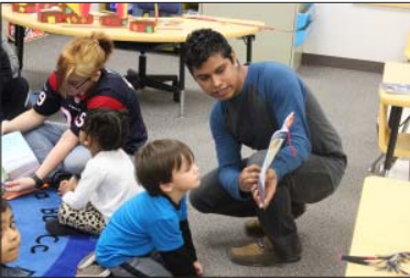
A student in the New Arrival program at the Joe Frank Campbell Learning Center in Channelview ISD reads to a Pre-Kindergarten student at the district's Early Childhood Center.