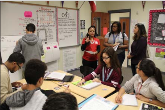
Aguirre AVID students showed Houston ISD teachers and administrators how they organize their binders for their classes. The binders help students to develop good organizational skills that will help them in high school and college.

The AVID program at Anthony Aguirre Junior High is becoming a model for secondary schools in other districts.