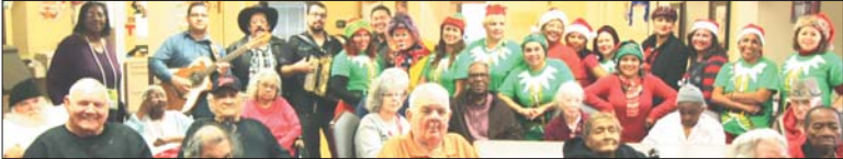
Residents and volunteers