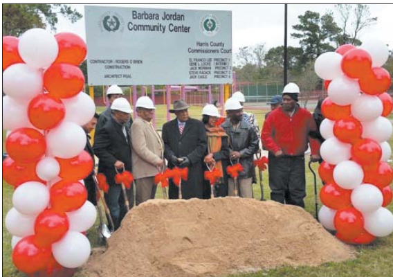
Community leaders attended the groundbreaking of Barbara Jordan Community Center.