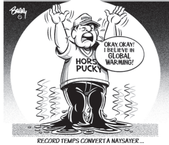
RECORD TEMPS CONVERT A NAYSAYER ...