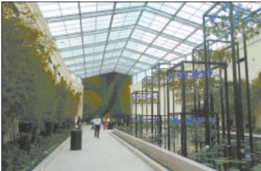
The Atrium includes birds, Koi fish, monkeys, and a variety of plants in a skylit environment with the Green Living Wall at one end.