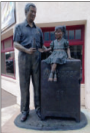
A retrospective of the oldest bottling company in Texas that sells Black Cherry Cola today and a variety of others.

named Snapple. They began selling the original Snapple in health clubs in 1973. The Unadulterated Food Corporation, later becoming Snapple Beverage Corp. Cadbury Schweppes was formed in 1969 with the merger of Cadbury and Schweppes, and over the ensuing three decades the company amassed the third largest share of the North American beverage market through a series of strategic acquisitions. In 1995, Cadbury Schweppes purchased Dr Pepper/Seven Up, Inc. The acquisition brought Dr Pepper and 7UP, along with IBC Root Beer and the Welch's soft drink line, into the Cadbury Schweppes family. They tell me in Dublin they can no longer associate themselves with Dr Pepper.