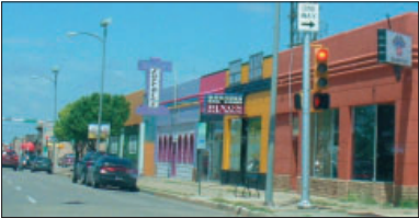
Quirky stores on Route 66 include the artists' haven the 806 Coffee Shop.

About a century later, three New York-area health food store owners created a unique apple soda they