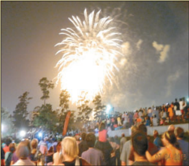
4th OF JULY, celebrated at Miller Outdoor Theater.