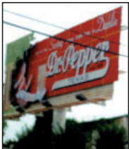
Attention grabber in Dublin, a New York City company bought the Texas beverage.

On to Abilene, we encountered what became a common sight throughout the South but without mention in the national press. A protest drive, featuring folks with the Battle Flag of The Confederacy and Old Glory flying from the back of pickups and cars on the day the