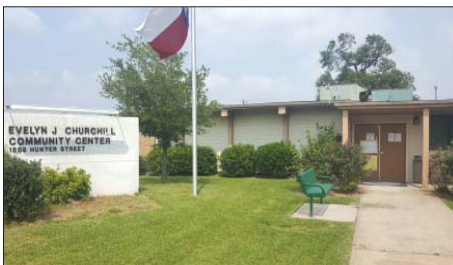
EVELYN CHURCHILL COMMUNITY CENTER in Galena Manor is now closed for remediation work.

Commissioners unanimously approved the bid from AAR Incorporated in the amount of $13,330.00 for the Phase 1 Evelyn Churchill Community Center for the partial mold remediation project.