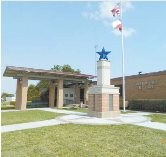
THE NEW GATEWAY MONUMENT is part of the Project Stars of the San Jacinto Historical District. Each of the 10 cities in the area served by EconomicAlliance Houston Port Region received money to build these monuments. Galena Park is number 9 in the series. The first Gateway was erected in La Porte in 2008. Although each design is different, responding to its setting, each has a Blue Star that lights at night. Project Stars is also responsible for the Historical Murals painted on the oil storage tanks along Highway 225 and Independence Parkway in Deer Park.

Janhsen of Knudson LP. Project Stars was originally conceived by Harris County Pct. 2 Commissioner Sylvia Garcia, and Jan Lawler of the EconomicAlliance starting in 2004. It was conceived as a trail of living history, as Project Stars will mark the route to Texas Independence as the historical markers highlight each city or location in East Harris County. Tourists and citizens are encouraged to "Follow the Stars" as they make their way from the Harrisburg region, all the way east to the San Jacinto Monument. This monument marks the site of one of the most significant battles in American history, where General Sam Houston led his Texas Army to victory and freed Texas from Mexico. Project Stars currently consists of four oil storage tanks painted with huge historical murals, and 9 gateway projects in the participating cities. Two of the murals are on Highway 225, one is on a VoPak tank on Independence aParkway, and the newest is on a tank in Baytown.