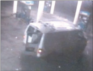
Suspect van that may have crashed into two stores in Crosby over the last month video taped.

CROSBY – Local residents were shocked by a van striking the Subway Sandwich Shop and later the Family Dollar Store by a van that backed into the glass structure and suspects bound forth and seized safes from the ground in both cases. Last week in nearby Northeast Houston a vehicle of the same description crashed into a gas station on Homestead Road and was video taped doing so and that tape was released to the internet. In this we are hopeful that the revelation can be of help and warning for storeowners.