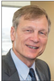
Rep. Brian Babin

"It is an honor for me to serve as Chairman of the Subcommittee on Space and continue working with my colleagues on the Committee to strengthen NASA's core exploration mission, create an environment for commercial space ventures to thrive, and build a clear vision for America's space program," said Rep. Babin. "I believe we are on the verge of sig-