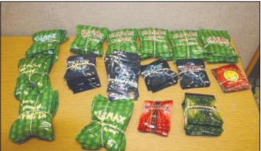
Samples of synthetic Marijuana.