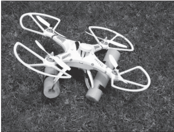
On the lawn of the Knights of Columbus Hall last Saturday a drone crash landed and the local Knights would like to find the owners. If it is yours and you can answer some questions about it call (281) 328-1104.