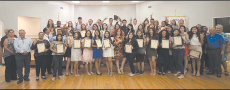
These are the GP/JC Rotary Club scholarship recipients for 2017. A total of 38 scholarships were awarded recently totalling -over 17,000.00 dollars.