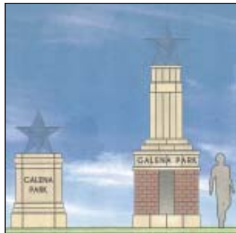
PRELIMINARY DESIGN STUDIES for the Monument.