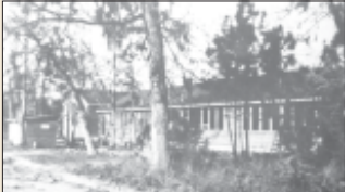
CLOVERLEAF ELEMENTARY SCHOOL in 1943, the first year it housed six classes.