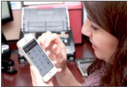
Parent trying for the mobile app for Goose Creek CISD.