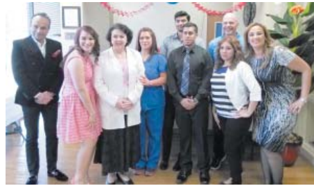
Staff at Excellence Clinic

15119 Wallisville Rd. Ste.#200 Houston, TX. 77049