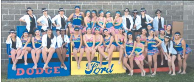
The Channelettes dance team took first place in the Production Category at the HTE Regional Competition and also earned a Sweepstakes Award.

•Children's Programs: -Children's Story Time is at 3 pm every Thursday. Join us for a story, finger play, and a fun craft! Preschool ages and up welcome. -Baby Story Time every Wednesday at 10:30 am. Fun interactive playing time and stories. Recommended for ages 0-2 years. •Children Holiday Program: -Spring Time Puppet Show. Join us Thursday, March 17 at 3 pm for a special presentation of the classic story, Tortoise and the Hare, re-enacted by puppets! Children of all ages are welcome. •Computer Classes: -1-on-1 Tech Help. We will be having a special session on Friday, March 11, 3-5pm to answer any questions regarding any digital device and smartphone. -Google Classes. Thursday, March 17, 11 am & 6 pm we will be teaching all things Google such as using the browser, maps and drive. You can bring your digital device or smartphone. •ELS Classes (Clases de Inglés) Cada Miercoles a las 12:30 pm. Es necesario inscribirse. Jacinto City Branch Library, 921 Akron, Jacinto City, TX. 77029. For more information on these and other programs at the library, please call 713-673-3237.