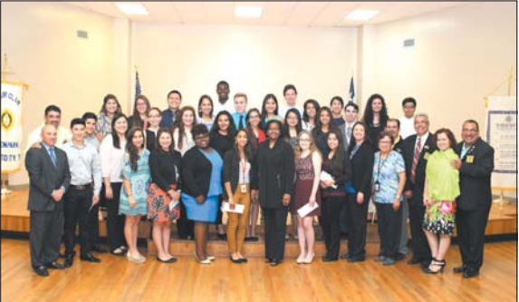
On Wednesday, May 4th, 25 Galena Park High School students received a total of $15,000.00 in scholarships from the Galena Park/Jacinto City Rotary Club. These scholarships will assist the students in pursuit of their college and career goals upon graduation.