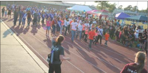
A large group of survivors wearing symbolic purple shirts makes the turn during the Survivor's Lap at the North Shore Ninth Grade Center.

more than $1 million toward cancer research for the past 13 years. The event will began with special introductions and presentations, followed by the opening lap of the evening – the Survivor's Lap. The Parade of Teams followed, with some of them wearing Star Wars themed outfits to get in the spirit of fun for the evening. Throughout the night, music from different groups was provided, along with a Disc Jockey – and was not unusual to find groups of people dancing in the middle of the football field. Also, community members and others made laps around the track and also participate in different "themed" laps. Relay attendees also put bids in on many Silent Auction items that were donated for the event. At dusk, the Luminaria Ceremony was held to remember those who valiantly fought the fight, those who continue to fight and