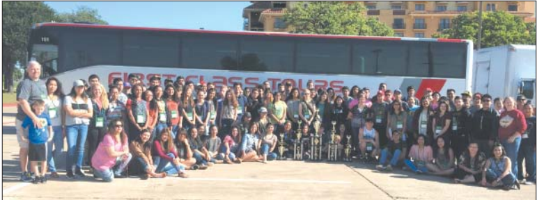
The Channelview High School Falcon band proudly displayed their trophies from the Spring in the Park Music Festival near Dallas.

Monday, May 16, 2016. At Battle Ground Golf Club - 8 am Shotgun Start. Call 713-384-4128 to register and more info.