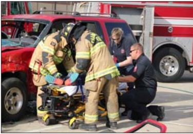
Emergency personnel place an accident victim onto a gurney during a simulated drunk driving crash as part of the Shattered Dreams program held at Channelview High School recently. “Shattered Dreams” is an educational program at Channelview High School designed to prevent teen drinking and driving. The event was sponsored by Ben Taub Hospital’s Trauma Services Department, a part of the Harris Health System.

The simulated crash took place near the Channelview High School campus in the parking lot of Ray Maddry Memorial Stadium. Channelview EMS and Fire Department, PHI Air Medical, Harris County Constable Precinct 3 deputies, along with other local emergen-