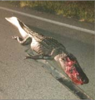
Dead alligator in the middle of the road after deputy's car hits him.