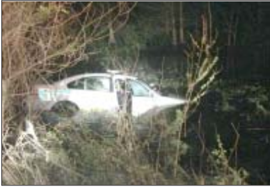
Deputy's car ends in a bayou. A Harris County Deputy was on patrol and began chasing suspected drug offenders but the suspects got away when the deputy's vehicle struck a 10 foot 8 inches alligator in Channelview on April 29. The deputy's patrol vehicle was declared a total loss by the insurance company because of the water damage after the vehicle drove into a bayou.

local government. Bockius said that they estimate property tax revenue to the City of Galena Park at $1.4 million annually, and $2 million to the school district. Another $900,000 would be paid to Harris County.