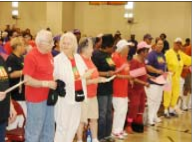
HUNDREDS of Seniors participated all week long in the various games of the Senior Olympics.