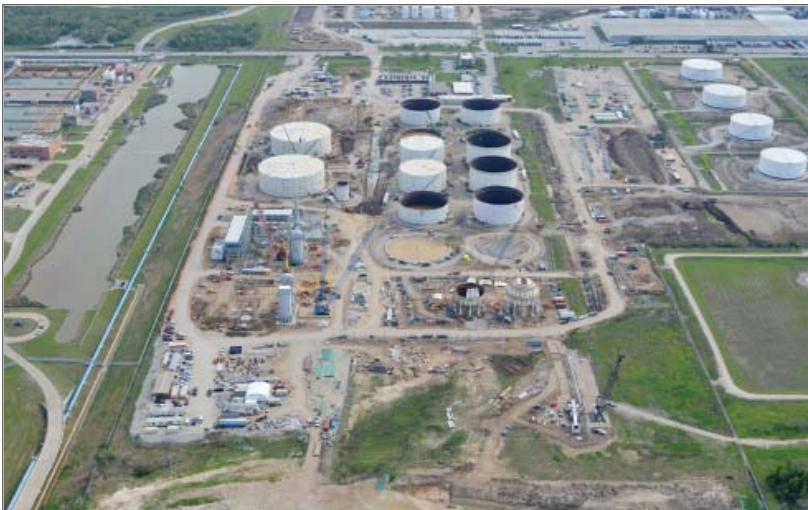
VIEW OF THE NEW KINDER-MORGAN SPLITTER PLANT, looking south toward Clinton Drive at the top of the photo. Condensate processing facilities are under construction at bottom of photo, taken in March.

plant, and showed slides of the site and the equipment. He said that the new "Splitter" would cost $370 million to build, and generate hundreds of temporary construction jobs and 23 full time positions. This is in addition to the 400+ employees that now work for Kinder-Morgan in the Galena Park area. Given industry standards, the community can expect another 150 jobs to be created in support of this plant by other businesses. Tax revenue paid by Kinder-Morgan for this plant will have an enormous impact on