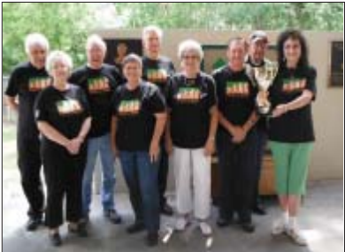
AWARD WINNERS with their trophy, just one of 19 categories of games with winning teams.