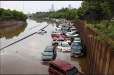
Monday evening these cars had come to a standstill on the North Freeway, near North Main. Water was too high for any vehicle to drive through, as seen in the empty travel lanes. Many roads, including this one, were not passable to late on Tuesday morning. These vehicles had made a u-turn in the Southbound lanes, but rapidly rising water caught them anyway.

HOUSTON – A massive rainstorm inundated the city and surrounding counties to the west, dropping as much as 11 inches of rain on West Houston in 8 hours, according to the National Weather Service. The storm started Monday evening, Memorial Day, and caught many drivers by surprise. Freeways were quickly flooded and impassable due to the heavy rainfall in such a short time. Other areas had similar inundation: North Houston had over 4 inches, and Channelview and East Harris County had 7+ inches in that short time. Harris County Office of See FLOODING, page 3