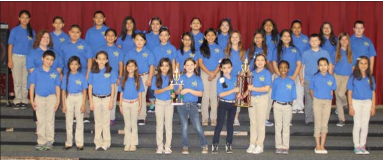
Channelview ISD's Schochler Elementary Honor Choir participated in the Splash Town Choral Festival recently. They received superior ratings from all three judges and finished as runner up in the 4th/5th grade category out of several Houston-area schools.