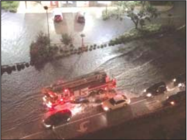
A HOUSTON FIRE TRUCK makes its way through high water Monday night, passing stranded cars parked on high ground. At top, flood waters reach parked cars at residences, and eventually entered the homes.