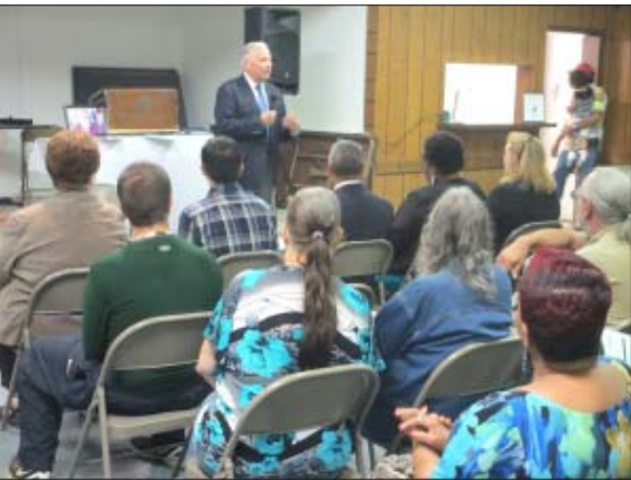
Rep. Gene Green addresses attendees at the Veterans Forum last Thursday, May 21, in Galena Park.