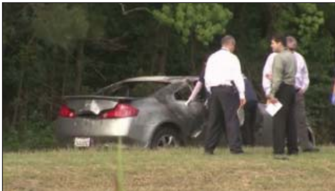
DEPUTIES INVESTIGATE burned car with body of dead man, found at John Ralston and Tidwell Road in Northeast Houston.

NORTHEAST -- Sheriff's deputies are investigating a man's body that was found in a burned car, at John Ralston and Tidwell Road in Northeast Houston. The incident was reported at about 4 a.m. on Friday morning, May 1.