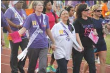
More than 175 cancer survivors participated in the Survivor's Lap at the Relay for Life-Houston North Channel.

At dusk, the Luminaria Ceremony was held to remember those who valiantly fought the fight, those who continue to fight and those who have lost their battle with cancer. Guests at the Relay purchased bags and designed them in memory or in honor of a family member or friend and the bag was placed around the track. As the stadium lights went dark, candles inside were lit for the ceremony.