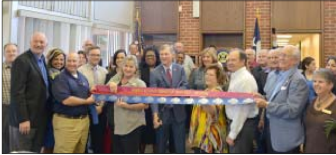
A ribbon cutting for the new office took place in Deer Park last Monday.

Deer Park, TX – U.S. Representative Brian Babin (TX-36) held an open house on Monday at his Deer Park District Office to welcome constituents and highlight the many services offered by his congressional office. Babin explained to the crowd that providing quality constituent services is one of his top priorities and that he has an experienced staff ready to assist local residents.