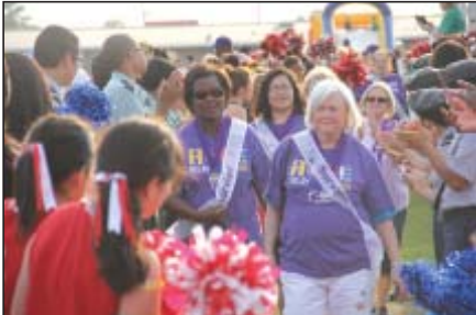
Cancer survivors are greeted onto the track through a spirit line of many supporters at the Relay for Life-Houston North Channel at the North Shore High School Ninth Grade Campus Track on May 1.