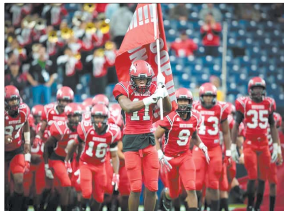
The North Shore Mustangs football team will have a neutral playoff game vs. Katy this Friday, November 25, 2016 at 12:00 p.m. at the NRG Stadium, Houston, TX. The Mustangs won 17-7 against Dickinson on November 18, 2016 at Sam Vitanza Stadium which put the team into the Semifinals. Follow North Shore (11-1) as they take on Katy (10-2) in the 2016 6A DI UIL Region III Semi-finals.