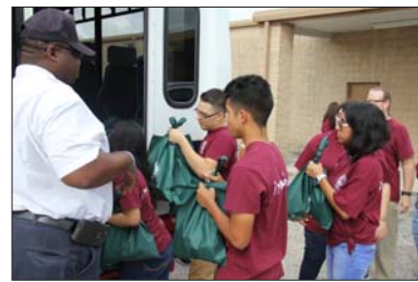
Channelview High School Interact Club members load care packages onto a bus traveling to the VA Hospital in Houston. The students and members of the North Shore Rotary Club and others gave the gifts to veterans who are undergoing treatment at the hospital.