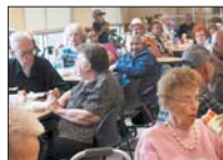
Jacinto City's Heritage Hall Senior's enjoying a Thanksgiving meal.