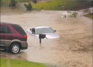
40 homes, and cars were under water in the Channelview area, according to the Harris County Office of Emergency Management.

NORTH CHANNEL – During this past weekend rainstorms and tornadoes struck the Houston area. East and Northeast Harris County were particularly hard hit by rainfall where up to 13 inches fell in some neighborhoods. In the greater Houston area, six tornadoes were reported from Freeport to Highlands. In Jacinto City, and along the East Freeway near Federal Road, high water caused closing of frontage roads. No deaths or serious injuries were