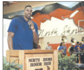
Houston Rocket standout Dwight Howard visited with students at North Shore Senior High School, encouraging them to stay focused on their goals.

As an avid user of modern technology, Howard warned them about social media and the disruption it can cause. "We live in a crazy social media driven society. I don't want you guys getting caught up in what's around you... caught up in the Internet and social media because it can distract you from what your purpose is in life," he said. "Social media is great... but sometimes put that phone down. Get to know the person next to you. Push that person to be greater than what they are right now. The more you do that, the better you all will become," he added. He followed this with a story of classmates he grew up with who were