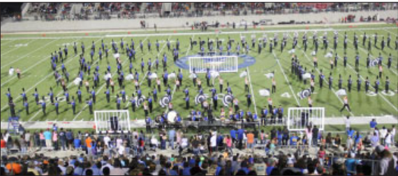
Falcon Marching Band