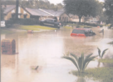
HOMES in some neighborhoods were completely flooded, as were streets and cars. Frontage roads along I-10 East were closed by authorities most of Saturday.

HARRIS COUNTY – Local voters showed support for their elected officials and passed every proposition in the state, county, and City of Baytown on Tuesday. In Harris County, all seven Propositions passed. Proposition 1 for road improvements at about $700 M. passed by 73% to 27%. Proposition 2 about funding improvements to parks passed 64% to 36%. Proposition #3 for an improved animal shelter passed 62% to 38%, the lowest of all county percentages. Proposition 4 for flood control work passed 74% to 26%. So the county can spend $64 M. to drain the areas. One Proposition that did not pass was the City of Houston, Proposition 1, the HERO proposition was voted down