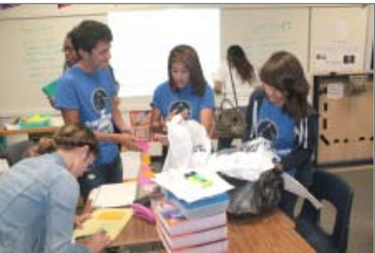
C.E. King students putting on practice SMART lunch program.