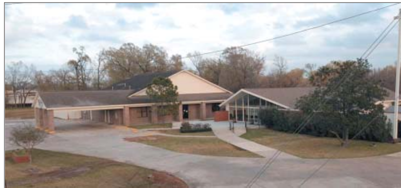
Old River Terrace United Methodist Church building located at 16102 East Fwy. in Channelview.

Early in 1939, the Methodist Church decided to build a church in Channelview, Texas. The property that was selected by the charter members was 2 blocks north of Market Street. The Texas Annual Conference questioned if people would find the church that far off the main road. That location, now on Interstate 10, became the home of Old River