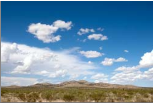
View of Sierra Madera

The sight must have been a spectacular one. While estimates vary, sometime around 100 million years ago, the skies above what would later become the dry desert grasslands between Fort Stockton and Marathon, Texas glowed in a brilliant light. Some scientist say that it was a comet while others say it might have been a meteor but either way, something big slammed into the and rises nearly 800 feet above the desert floor and is only 600 feet shy of towering a mile above sea level. The structure was formed when the extraterrestrial object slammed into the earth and caused the underlying limestone to be projected upwards in the collision. Think of it like this: When you drop a stone into water, a crater is first created and then a central peak rebounds in the