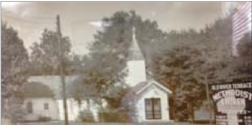
Old building of Old River Terrace United Methodist Church in Channelview, Texas.