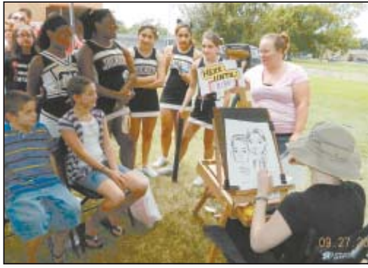
A VERY SKILLFUL CHARICATURE ARTIST was on hand to leave you with a drawing of a familiar face -- yours.