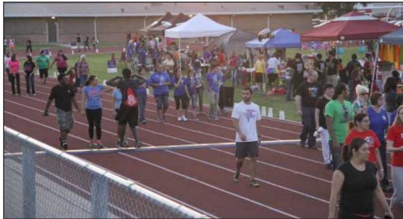
The Relay For Life of Houston North Channel is held at the beginning of every May and requires the help of many volunteers in a variety of different areas for this large scale event. The group is seeking volunteers to assist with the coordination of the 2015 event.