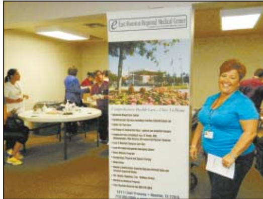
EAST HOUSTON MEDICAL CENTER had health screenings for cholesterol, blood pressure, eye exams, hearing tests, and information on other health resources, said Traci Dillard.