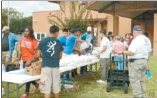
NORTH CHANNEL ASSISTANCE MINISTRIES supervised the distribution of food from the Food Bank and their inventory.