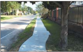
New sidewalk on Barbara Mae Street between Holly Park Drive and Alderson Street.