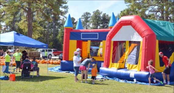
Each year, the inflatables provide excitement for children and youth.

Lake Houston United Methodist Church in Huffman will be hosting a day full of fun and entertainment at their annual Fall Festival on Saturday, October 15 from 10am-3pm.