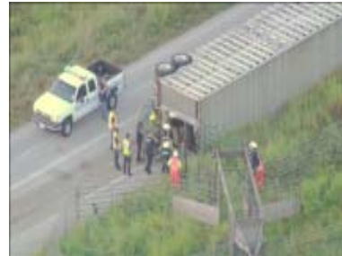
This semi trailer truck, hauling about 120 cattle, overturned when its load shifted, and it rolled in a ditch. The accident killed 30+ cattle, and closed the road for many hours.

Main lanes of Highway 90 and South Lake Houston Parkway were closed for about 5 hours, until 9 a.m. so that the cattle and truck could be removed.