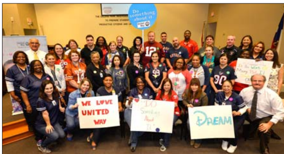
United Way Campaign continues through Oct. 28, 2016.

United Way serves the students of Houston through their Education Initiative. This program helps make an impact on students' success through early childhood