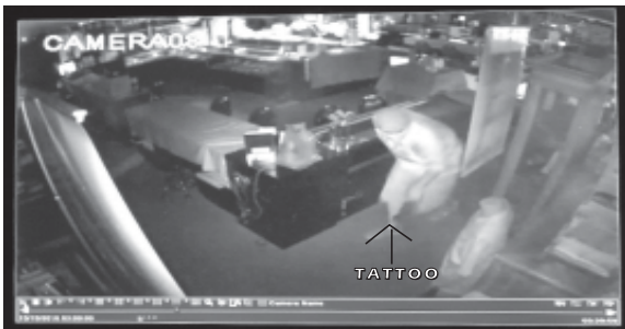
THE BURGLAR stealthily moves inside the store, taking jewelry from several display cases and drawers. He also found an M1 rifle with an expensive scope that he took. Alarm systems failed to alert the owner, who was in another part of the building.