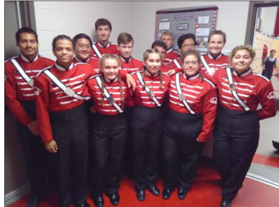
The Big Red Machine would like you to meet the Trumpet section. Members of the CHS band leadership chose the Trumpet section as this week's section of the week. This outstanding section was chosen for the students' enthusiasm, preparedness, time management and of course their wonderful music and marching skills.

Congratulations to the Trumpet section and Star Student of the Week.