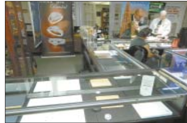
Three empty display cases attest to the huge loss.