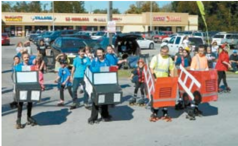
Prince's Roller Rink won Best of Show, and Best Commercial Entry for this interpretation of police cars and fire engines.