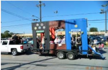
ZXP's float honored military and veterans, teachers, and law enforcement officers.