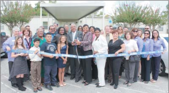
The newly renovated Southside Clinic located at the Galena Park Community Resource & Training Center located at 1721 16th St. Galena Park, Tx. 77547.