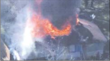
Smoke coming out from the roof of the house located on Colvin St. and Wallisville Rd.