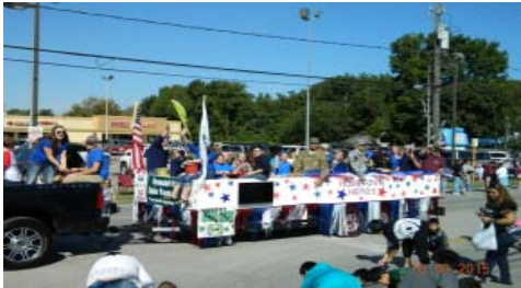
Cedar Bayou 4-H had a float that paid homage to veterans and First Responders.