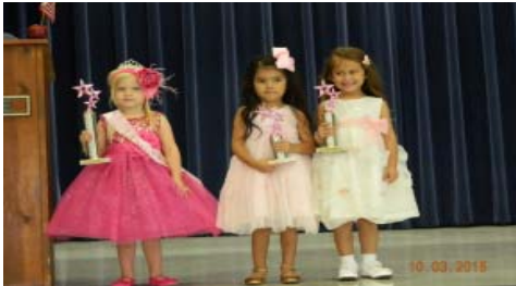
Posing with their trophies are winners in the 2 to 3 year old category of the Little Miss & Mr. Highlands competition.