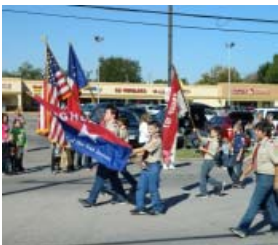
Boy Scout Troop 107 carried the Flags at the front of the Parade.