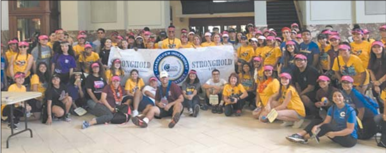
More than 175 Channelview ISD employees, students and other district supporters participated on Team CISD as part of the Walk for Autism Speaks event at Minute Maid Park recently. The annual event focuses on raising awareness of Autism Spectrum Disorder.