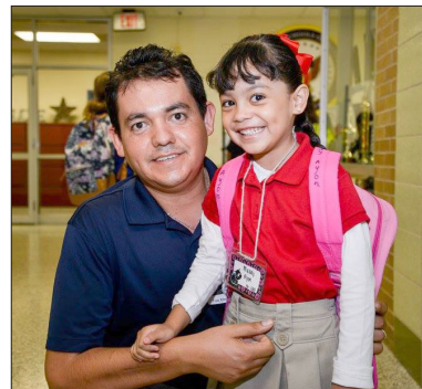
Fathers celebrating "Fathers National Day" by taking their kids to school at Galena Park ISD.