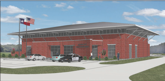
ARCHITECT'S RENDERING OF THE NEW JACINTO CITY POLICE STATION.

Architect Ed Gant stated that the building will be