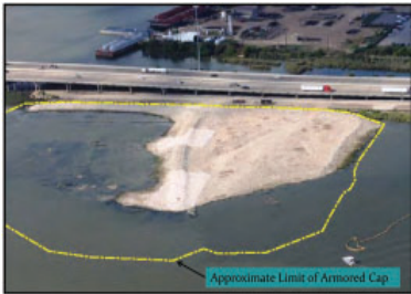
IN THE EPA PROPOSED PLAN, the North and South compounds would be remediated by dry excavation of the toxic wastes. There would be no wet dredging. This method contains the toxic wastes.

DALLAS – Sept. 28, 2016 Today, the U.S. Environmental Protection Agency (EPA) announced the proposed plan to address contamination at the San Jacinto waste pits Superfund site in Harris County, Texas. After careful review of all available information, EPA's preferred remedy proposes removing a total of about 202,000 cubic yards of con-