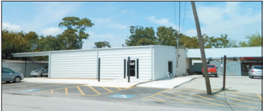
The new metal building on Freepoint Street is an addition to the North Channel Assistance Ministries main building. It still needs work to finish the interior offices and work areas.