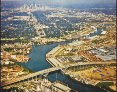
AERIAL VIEW OF THE SHIP CHANNEL, AS IT APPROACHES THE I-610 EAST BRIDGE.

To keep up with the expansion of container business, and the new SuperMax ships crossing the Panama Canal, the Port has installed four SuperMax cranes at Barbers Cut, and plans on 4 more at the Bayport terminal before the end of the year.