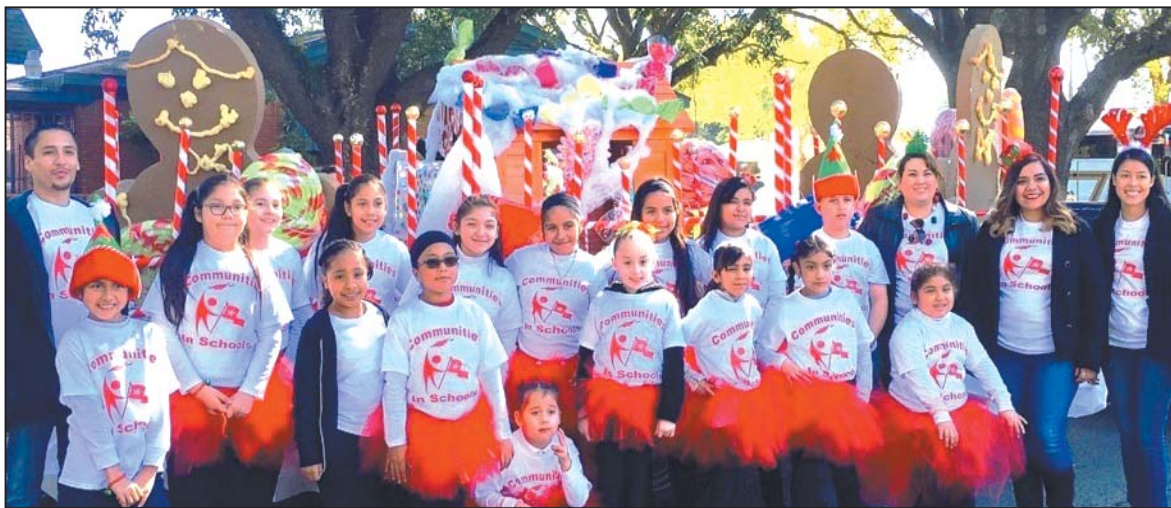
Children, parents and teachers of Communities In Schools at the 2nd Annual Galena Park Christmas Parade.