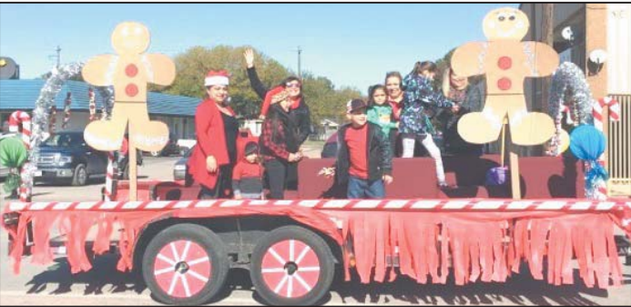
Candy Land city administration float.