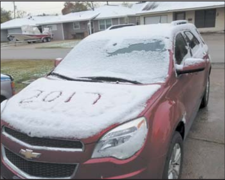
North Channel Star writer Allan Jamail's snow covered car.

were seeing their first snow. Snowmen and snow angels were made, and rooftops and the hoods of vehicles were blanketed with snow. I researched the last snowfall in Houston to learn it was December 4, 2009, and one inch