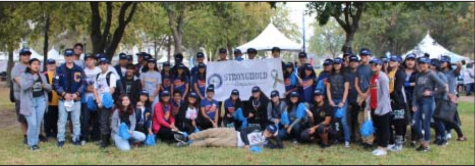
More than 150 Channelview ISD employees, students and other district supporters participated on Team CISD as part of the Walk for Autism Speaks event at the University of Houston's Lynn Eusan Park recently. The annual event focuses on raising awareness of Autism Spectrum Disorder.

Channelview ISD educators, students and support staff put on their walking shoes for a good cause as they participated in the Walk for Autism Speaks event on Dec. 3 at the University of Houston's Lynn Eusan Park. More than 150 Channelview High School students, members of the Falcon baseball team, the Chan- nelettes dance team, the