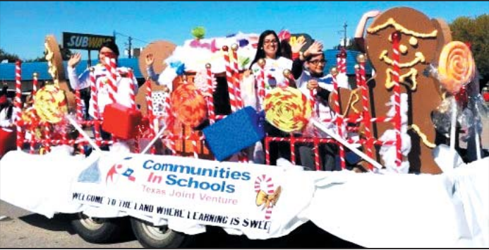
Communities In Schools float.