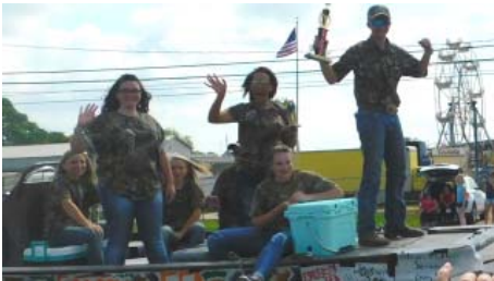
Crosby FFA fishing for Members