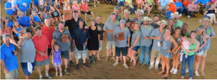
Ribs 3rd place- Has Been Cookers, 1st place-- Boss Hogg Cookers, 2nd place- Backseat Cookers (Not Shown) 4th -Boss Hogg Cookers, 5th -- Bohica