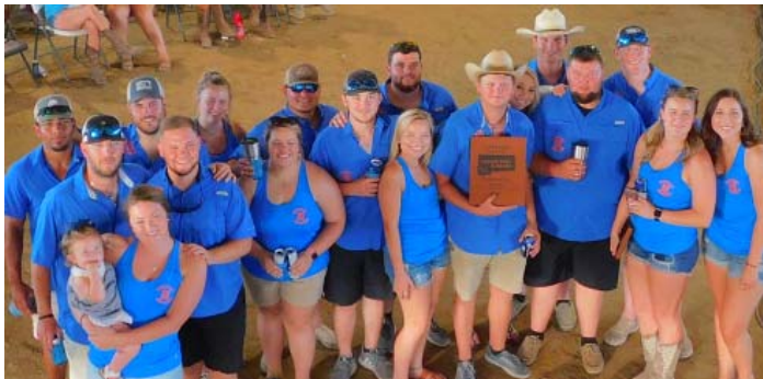
Showmanship-- Beerkat Cookers