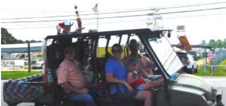
Belly Flop with Trophy