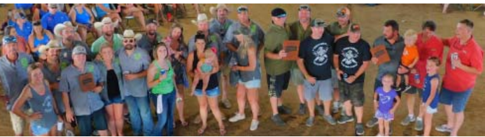
Fajitas 3rd place--Backseat Cookers 1st place-- War Pigs, 2nd place--Has Been Cookers (Not Shown) 4th - Outlaw Ray's, 5th - Lone Star Legends