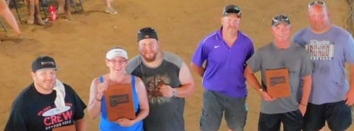
Chicken 3rd place-- Inlaws & Outlaws , 1st place-- Funky Monkey, 2nd place-- Rustbucket (Not Shown) 4th-- War Pigs, 5th -- Has Been