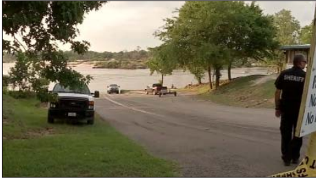
Harris County Deputies investigate the scene at Magnolia Garden Park where a 12 year-old girl drowned after helping her mother.