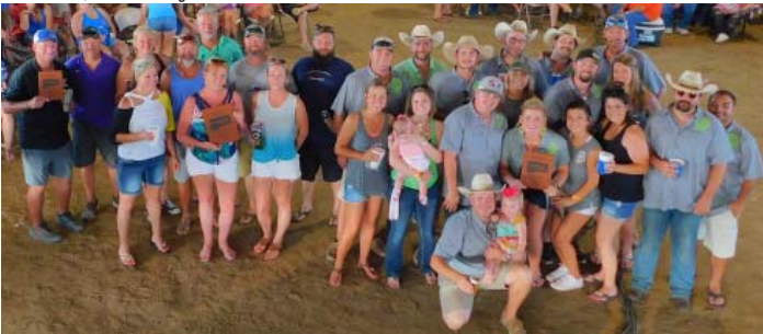
Open Dish 3rd place-- Rustbucket,1st place-- Stumble In, 2nd place-- Backseat Cookers (Not Shown) 4th place-- Hula Hu Girls, 5th place-- DANA