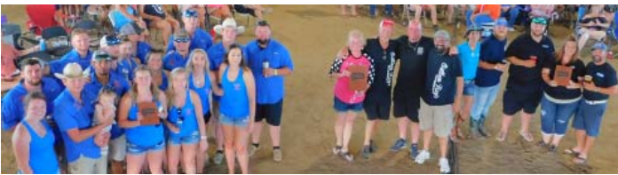
Margaritas 3rd place- BeerKat Cookers, 1st place-Outlaw Ray's, 2nd place-- Frank's Collision, (Not Shown)4th- Bare-foot Texans, 5th - Dun Right Cookers