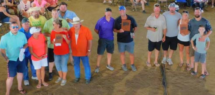
Open Dish--Dessert 3rd place-- Hula Hut, 1st place--Rustbucket, 2nd place-- Woods Brothers, (Not Shown) 4th - Backseat Cookers, 5th - SS Cookers