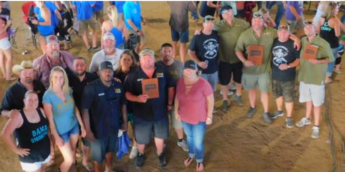
Brisket 1st place-and 3rd- War Pigs 2nd place-- DANA, (Not Shown) 4th place-- Funky Monkey, 5th place-- Backseat Cookers