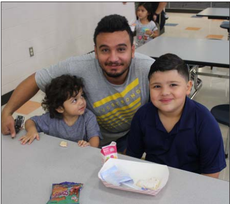
Harvey Brown Elementary welcomes families on the first day of the new year