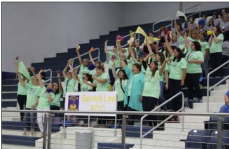
Staff members from the Early Childhood Center are excited about the new school year.

District Convocation was the first formal ceremony that framed the academic year. It allowed employees to come together with their school spirit shirts and department attire to join forces in celebrating the many accomplishments throughout the district. It was also an opportunity to set the tone for a successful 2018-2019 school year. This year's back-to-school convocation included Chan-