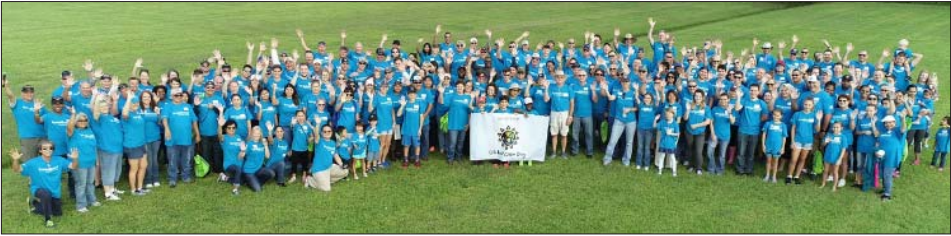
An army of volunteers from LyondellBasell's Channelview Complex, Houston Technology Center and Houston Engineering Center participated in seven different service projects in the Channelview area during the company's annual Global Care Day event last Saturday.

vital resource to the community and provides an opportunity for folks to fish, view wildlife and just enjoy being outdoors. Having a lake cleanup project day allows for a larger scale litter collection that makes this a more enjoyable place for the community, park visitors, and the wildlife that lives there."