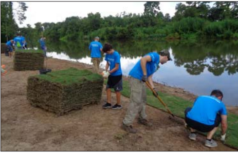
LyondellBasell Houston Technology Center volunteers plant new sod and cleaned up trash around Sheldon Reservoir at Sheldon Lake State Park and Environmental Learning Center.