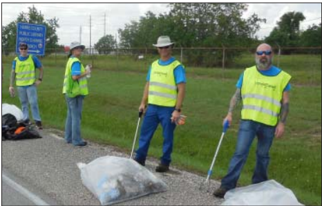
Volunteers from LyondellBasell's Channelview Complex cleaned up trash along Sheldon Road as part of an Adopt-a-Road service project for Global Care Day last weekend.