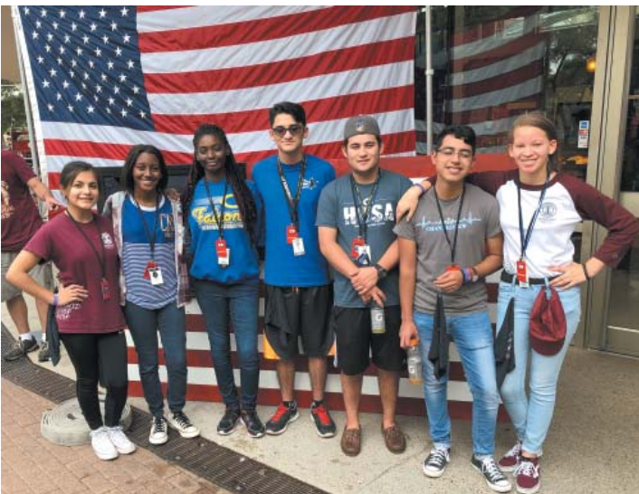
Channelview High School's InterAct Club volunteers for the SA110 Memorial Climb

September 11th is a day that haunts many Americans over the age of 24. Across the United States, many fire departments host memorial climbs or memorial 5ks for this American tragedy. In San Antonio, TX the SA110 hosts one of the largest September 11th Memorial Climbs in the state. At this memorial, firefighters, police officers, paramedics, EMT's, and civilians come together to remember the sacrifices those brave men and women made on that tragic day. The first responders of 9/11 climbed 110 stories into the Twin Towers, so the first responders of today climb 110 stories (the Tower of the Americas twice) in remembrance of that sacrifice. Each climber carries a tag for a fallen brother for another climb. The first responders climbed with a fallen brother or sister's name, picture, and an information card to pay tribute to their memory. One