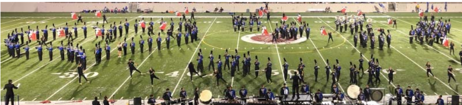
Channelview High School Band