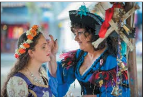
Texas Renaissance Festival festivities from last year's event, held at Todd Mission, 50 miles north of Houston.

HOUSTON – Magic, merriment and majesty await at this year's Texas Renaissance Festival, the nation's largest Renaissance-themed event, now announcing unique themes for all nine festival weekends, from September 29 to November 25, 2018, and a brand new season pass, The Royal Pass. In 2017, Texas Renaissance Festival saw its second highest attendance season, welcoming a total of 644,917 attendees, while facilitating 63 weddings, the most recorded in a single season. Texas Renaissance Festival also saw a 14 percent increase in campers from the previous year, hosting 23,000 guests in the campgrounds – suited perfectly for both those seeking nighttime thrills around a bonfire, and families seeking a quiet retreat with a place to shake off the fairy dust. “We encourage the noblest lords and ladies of the land who are interested in purchasing Festival tickets to secure the Royal Pass at once to get the most savings -- up to 68% off admission, with many free perks