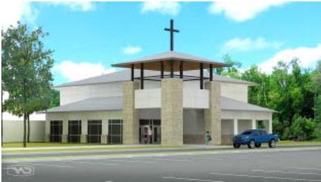
Preliminary architectural rendering of exterior design being considered for new Lake Houston UMC sanctuary featuring double the space and seating of original sanctuary, plus gathering space for before and after worship, and additional restrooms and connection to the existing campus.