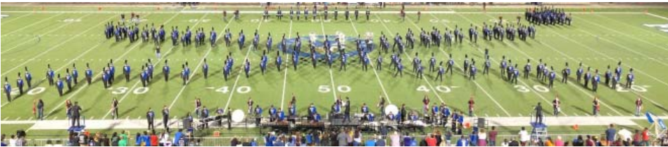
After overcoming many obstacles, Channelview High School band takes the field for a grand performance.

The Channelview High School band, against all odds, is marching to the beat of A Rose by any Other Name, as they open the season with a performance dedicated to symbols of love.