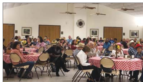
Several hundred Senior Citizens Dined and Danced.