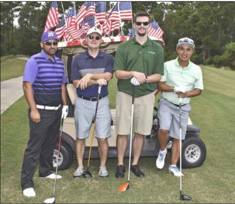
The San Jacinto College Foundation will host its 23rd annual golf tournament on Tuesday, Oct. 2, at the Golf Club of Houston, home to the prestigious PGA Tour's Houston Open.