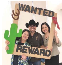
All attendees had their picture taken in the Wanted Frame.