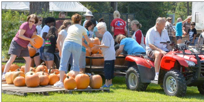
The pumpkins arrive in a tractor trailer and are unloaded by LHUMC members and friends.

The Pumpkin Patch opens Monday, October 8, 2018! Each year for the last 17 years, Lake Houston United Methodist Church has been home to a large Pumpkin Patch with over 1,000 pumpkins with a wide variety of shapes and sizes. Before the opening of the Patch, LHUMC members and