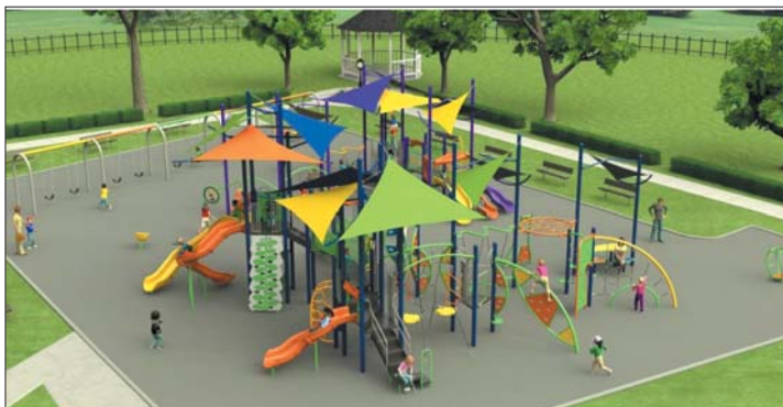
Concept for North Shore Park's new playground sets.

NORTH CHANNEL, Texas - Commissioner Jack Morman is proud to announce the start of construction on September 26th for North Shore Park's new playgrounds. This project includes the replacement of older playground equipment and installation of rubberized fall surfaces, shade canopies, and benches. The playground sets will