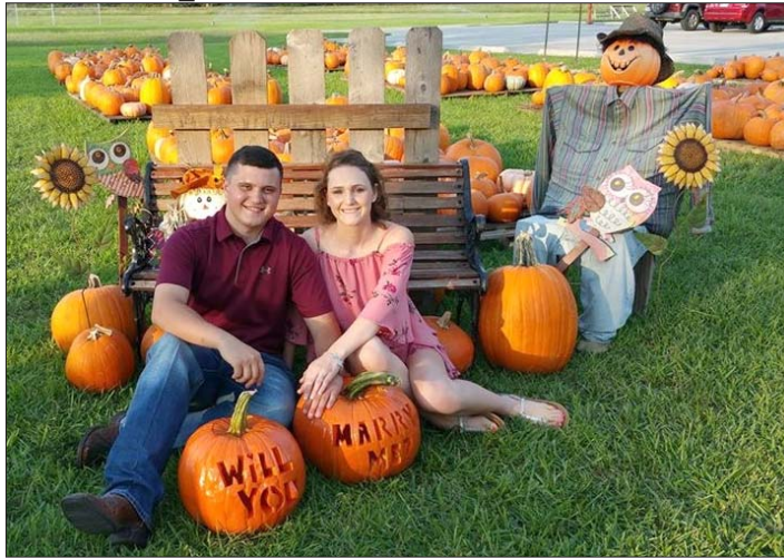
A beautiful couple was engaged in the Pumpkin Patch at LHUMC last year.