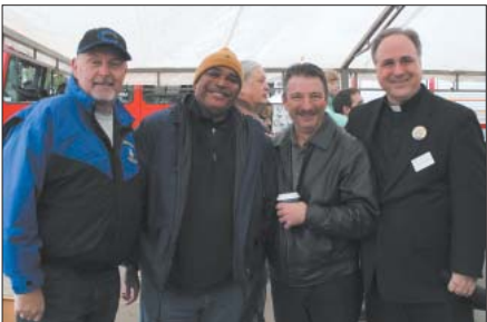
The Channelview Ministry Team volunteered their service during the Christmas Toy Drive.

Elementary, Crenshaw Elementary, DeZavala Elementary, Schochler Elementary, and Alice Johnson Junior High entertained guests who showed their holiday spirit by donating toys, gift cards, and money. The Community Toy Drive “Every Child Deserves a Christmas” was